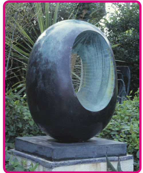
Dame Barbara Hepworth, Spring , 1966 © Bowness, Hepworth Estate

Let's make a Barbara Hepworth-inspired necklace which we can look through! Hepworth made here sculptures to frame the landscape and to make you look at things differently. What can you see through your necklace?